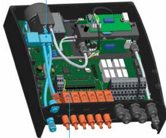
6-valve manifold to the suction port switch