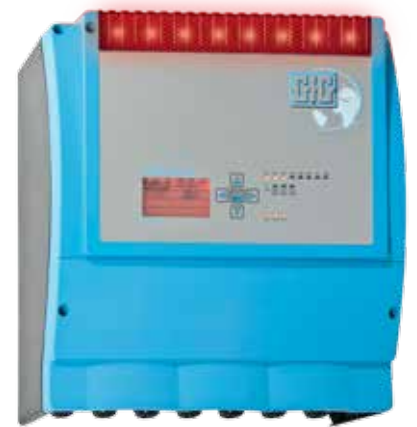
GMA 200-MW in IP65 wall-mounted housing