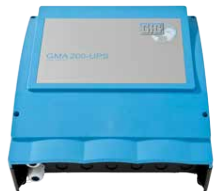
Redundant power supply in IP65 wall-mounted housing: GMA200-UPS