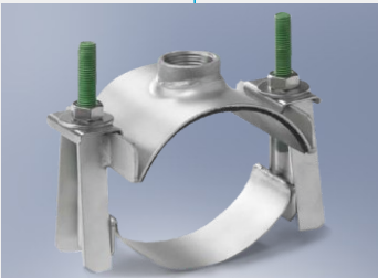
Tapping saddle for diameters between 100 and 400 mm